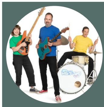
Will's Jams Musicians