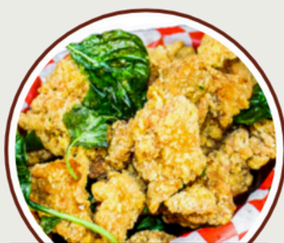
TAIWANESE JAN 29