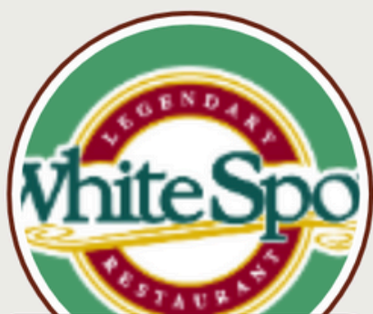
WHITE SPOT FEB 12