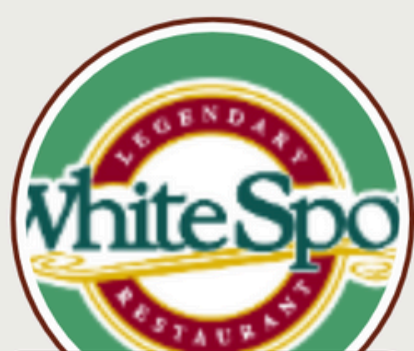
WHITE SPOT FEB 12