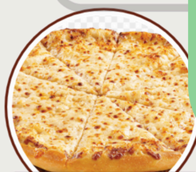
PIZZA FEB 5