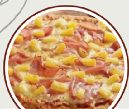
PIZZA JAN 15