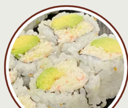
SUSHI LOVERS FEB 26