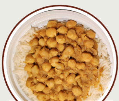
CURRY RICE/PASTA FEB 19