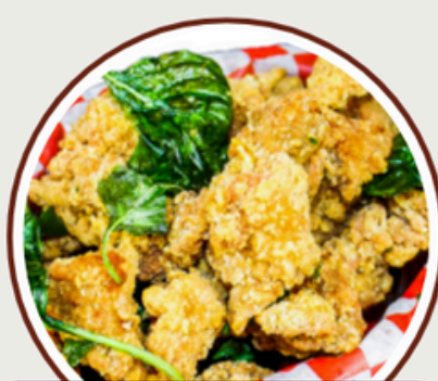
TAIWANESE JAN 29