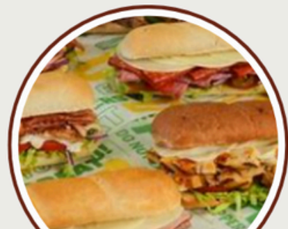
SUBWAY MAR 12