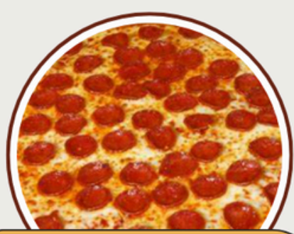
PIZZA MAR 5