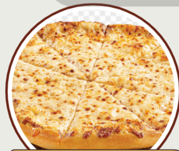
PIZZA FEB 5