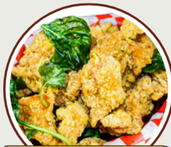
TAIWANESE JAN 29