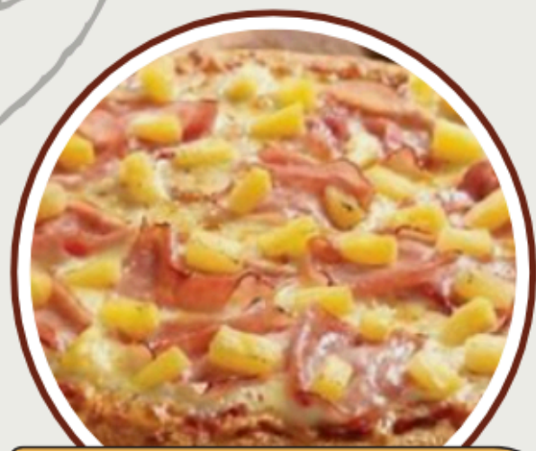
PIZZA JAN 15