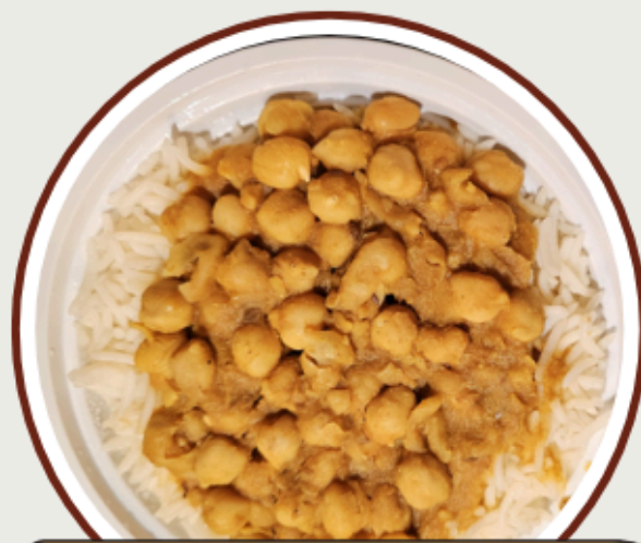
CURRY RICE/PASTA FEB 19