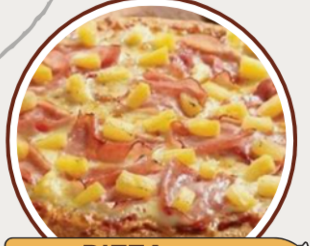
PIZZA JAN 15