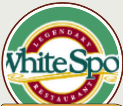
WHITE SPOT FEB 12