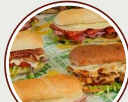
SUBWAY MAR 12