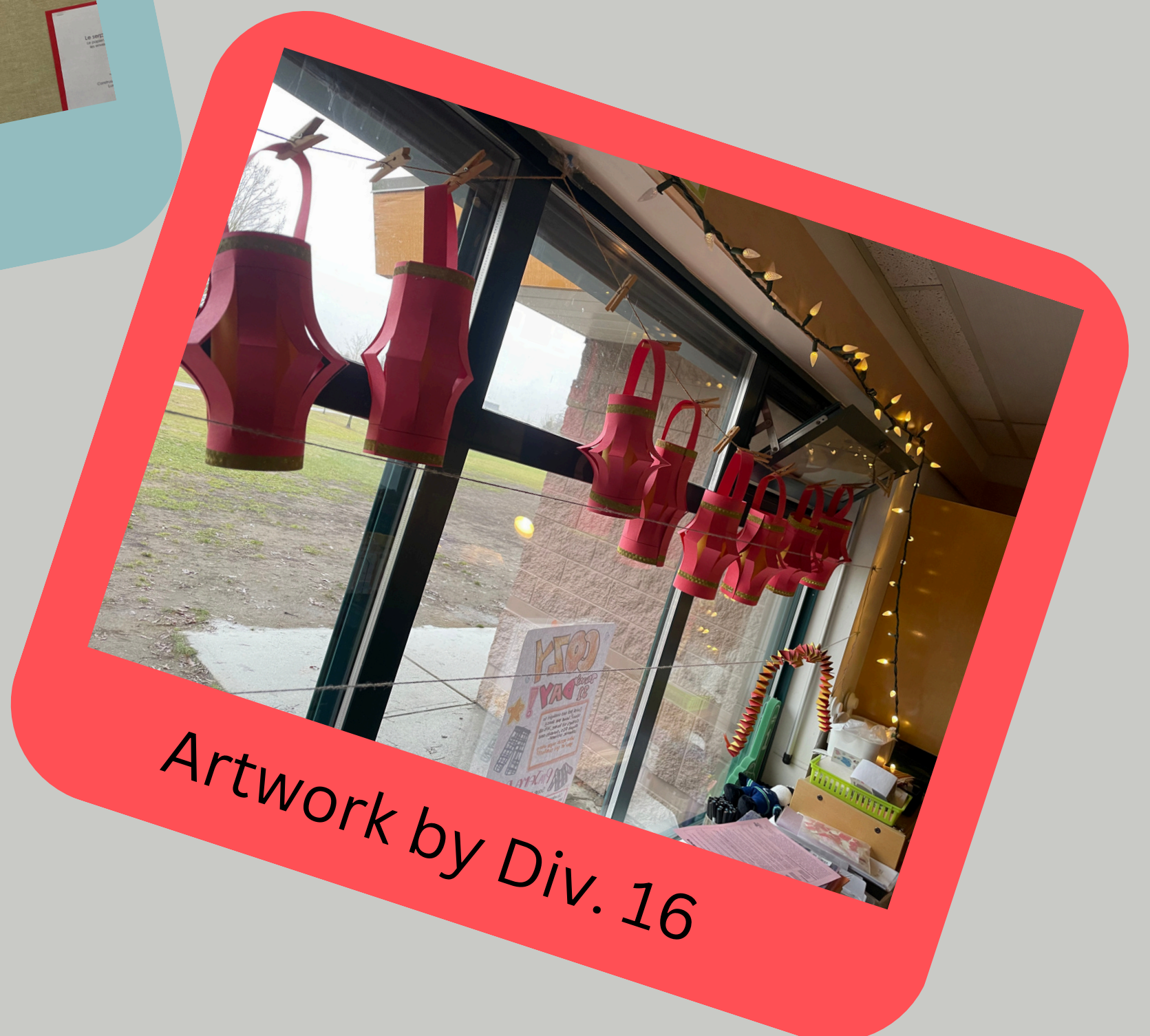
Artwork by Div. 16