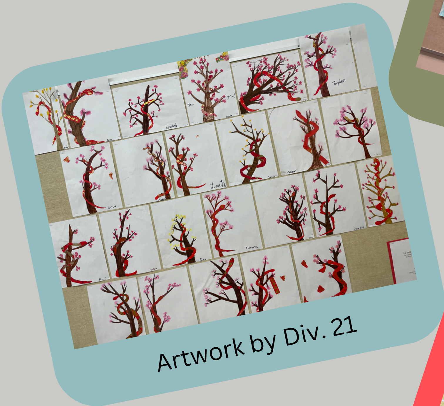
Artwork by Div. 21