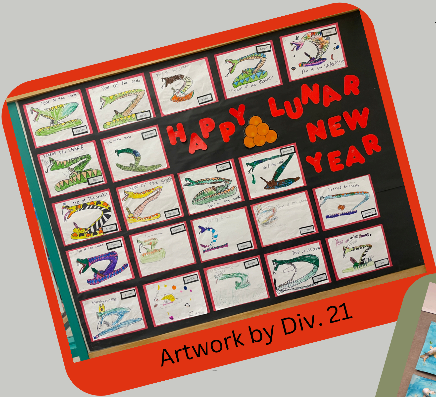
Artwork by Div. 21