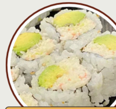
SUSHI LOVERS FEB 26