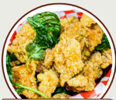
TAIWANESE JAN 29