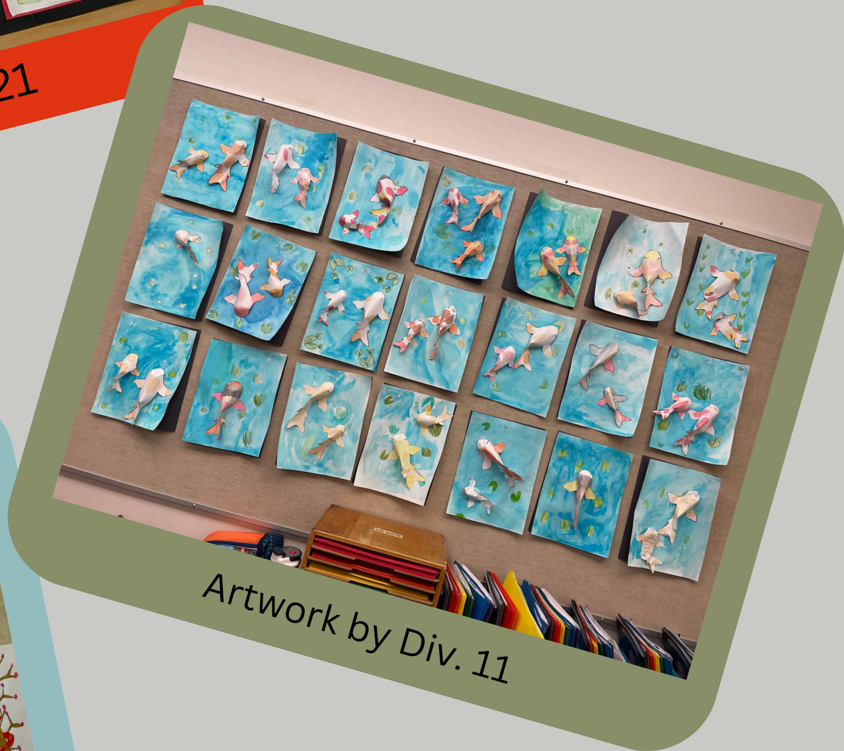
Artwork by Div. 11