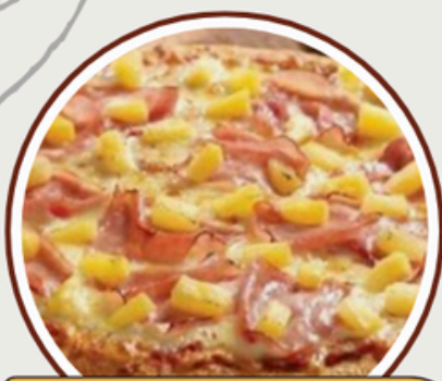
PIZZA JAN 15