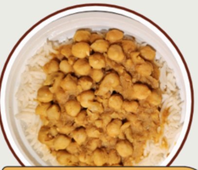
CURRY RICE/PASTA FEB 19