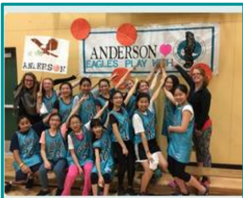
GIRLS' BASKETBALL TEAM

Thank you for helping to keep our parking lot safe for our children.